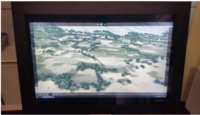
Figure 6. The screen of the working station used for usability testing

Usability test plan and supporting documents were prepared following the usability test guidelines [6]. For the testing environment we used the room with a working station which is normally used for running and exercising the latest versions of software. The screen of the working station is shown in Figure 6, and the whole environment prepared for usability testing in Figure 7, respectively.