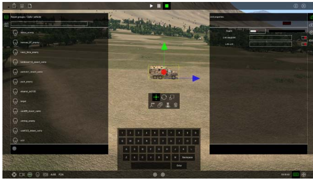
Figure 2. Working prototype of the new GUI

Previous interface, has been based solely on interaction via computer mouse and keyboard. Modern technologies require completely different approaches, dealing with multi-touch displays, and other devices that are able to run graphically demanding 3D environment, but do not use conventional computer input devices. Consequently, the new user interface should support multi-touch display and additional features such as the possibility of independent setting and editing scripts via an additional software package or a dedicated application. The new concept, generated through a series of brainstorming sessions and design iterations resulted in a new user interface, which has been evaluated with the performed usability testing. The working prototype of the new user interface is shown in Figure 2.