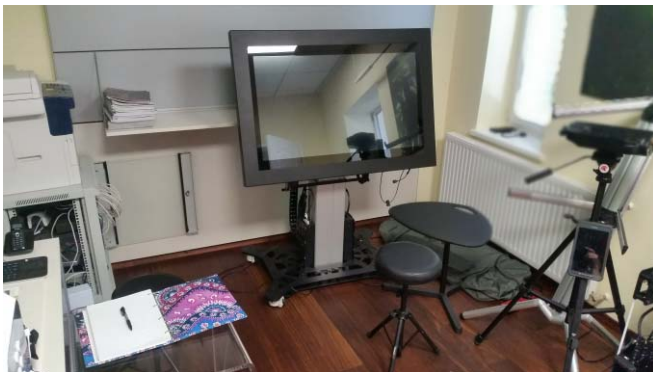
Figure 7. Usability testing environment

The selection and acquisition of participants whose background and skills are representative of those that will use the product is a crucial element of the testing process [5]. Selecting participants involves identifying and describing the relevant behavior, skills, and knowledge of the person(s) who will use your product. Within the company we managed to collect twelve participants, with different backgrounds that could be roughly categorized in three groups: a group from the hardware department, a group of participants of administrative nature, and a group originating from software industry with artists, designers