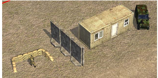
Figure 3. First step of testing scenario

The main goal of usability testing was to verify the adequacy of the conceptual design of the fully renewed appearance of the user interface. Consequently, the performed tests should check the ease of use, the perception of the individual sets of operations, the appropriateness of the composed sequence of operations, logic operations alone, feasibility of transformations on objects, as well as the ease of performing the actual flow of individual steps of the required test scenario. For this purpose, three step testing scenario (shown in Figures 3, 4 and 5) has been prepared.