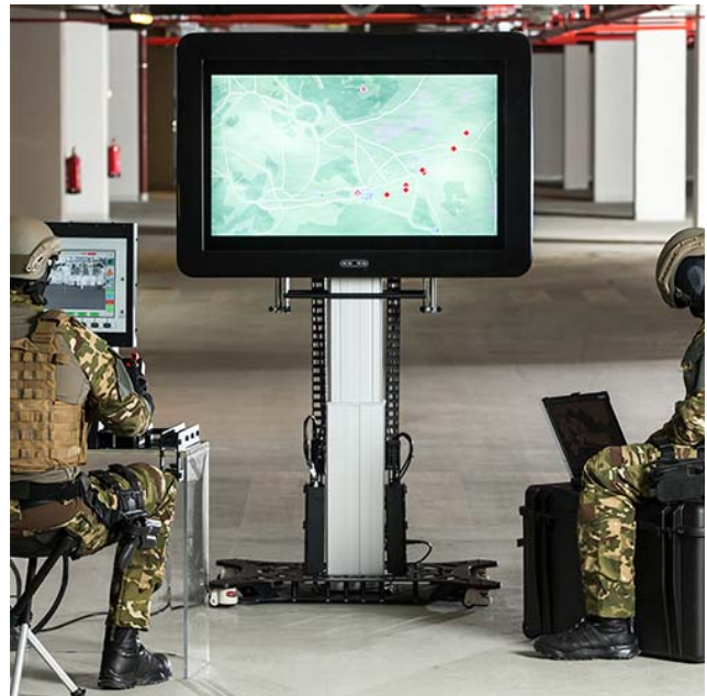
Figure 1. GUARD Control Desk

effects accompanied by real-time weather and time-of-day changes. GUARD brings indoor training to the edge of real combat awareness and moves digital training borders towards real battlefield perception. The 3D real-time simulations reflect situations from the real world. Which objects take place in the 3D scene, what is the nature of the 3D scene and how the objects behave within the scene is a matter of the information recorded in the script.