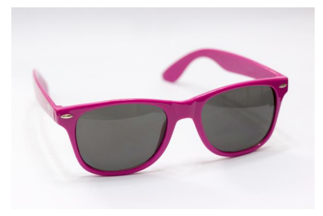
Figure 1. Most common "wayfarer style" sunglasses.

The device was designed to integrate into existing sunglasses which are widely available at very low cost. After some investigation we concluded the almost all low cost sunglasses have same lens shape (Fig. 1). This and the fact that such sunglasses can cost a bargain motivated us to use the shape of such lenses for our base modules.