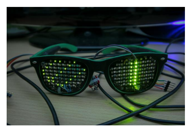
Figure 4. Working prototype of MCS device.

As expected few mistakes were made at designing the first prototype such as wrong component placement/connection and a faulty fabrication of the circuit board. After minor workarounds the MCS device became functional as expected albeit the initial design and fabrication mistakes. The first prototype looks very promising. A second version has already been designed.