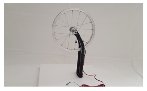
Figure 4. The exercise bike simulator.

speed sensor. For presentation purposes we implemented this unit as an exercise bike simulator shown in Figure 4.