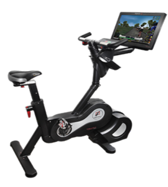
Figure 1. A dedicated "virtual reality" indoor exercise bike.

The first category consists of dedicated bike systems, adapted for use with virtual reality technology. Such systems are custom made and embedded in exercise bikes (in the gym) and upgrade the exercise bike with the necessary sensors that allow the user to control the video clip that is displayed on a pre-mounted display attached to the bike. An example of such a bike is shown in Figure 1.