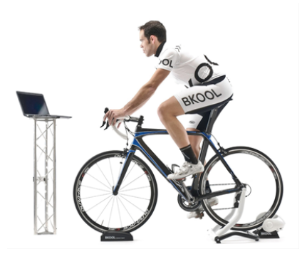
Figure 2. A device under a real road bike.

The second category of systems aims at bringing the cycling experience even closer to reality. This category includes devices designed for use with a real road bike. Such upgrade normally consists of two units: each one is placed under the rim of the wheel, as shown in Figure 2. The unit under the rear wheel is responsible for controlling the cycling speed and therefore the speed of video playback. At the same time, it acts as a resistor in cases where we want to simulate cycling uphill. The unit, which is mounted under the front wheel, can be reserved exclusively for ensuring the stability of the bike, the more advanced systems can record the angle of the steering wheel and, via a computer system, the image on the screen is shifted accordingly. More such bikes can be connected into the same network offering the possibility of multiplayer bike races [9] or a true VR headset can be connected to the system offering a more realistic experience [16].